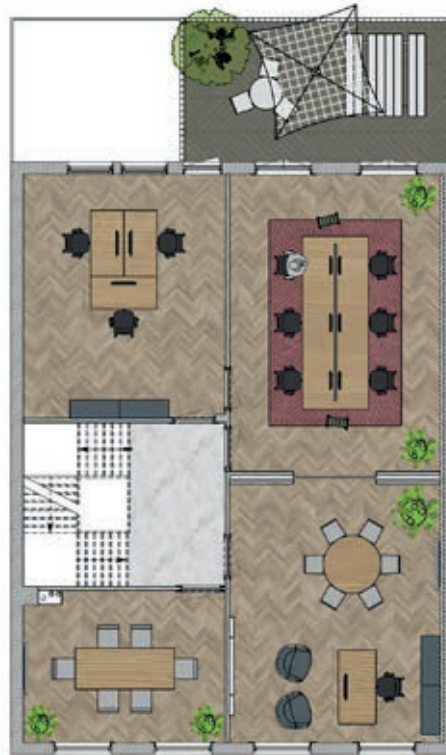
Zeestraat 66A FIRST FLOOR