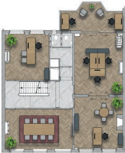
Zeestraat 62 FIRST FLOOR