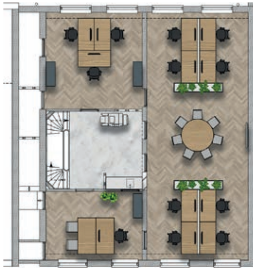
Zeestraat 66 FIRST FLOOR